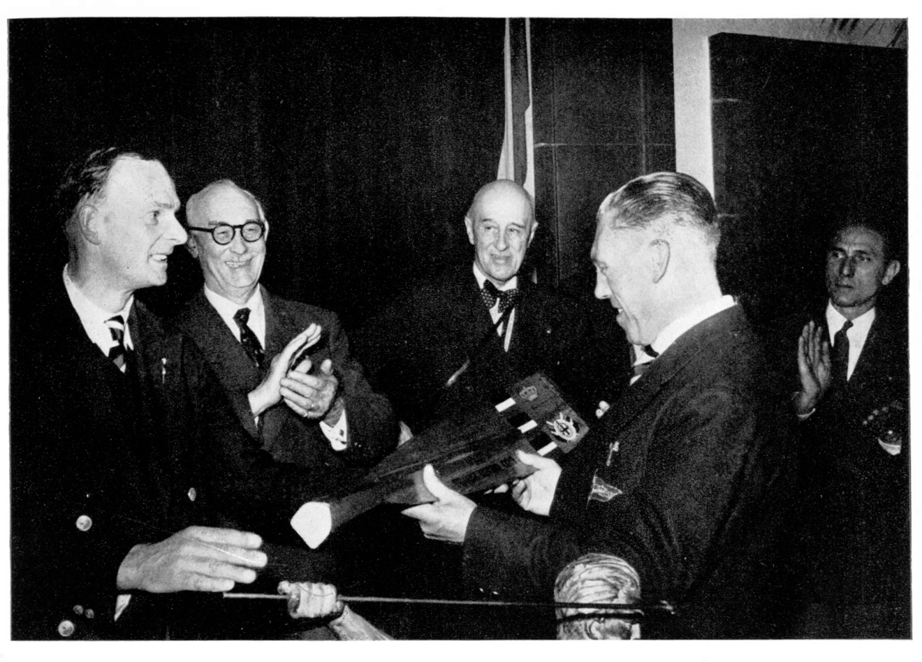
OSTENDE REGATTA 1955. The Captain presents a Thames blade to the Mayor, after the prize-giving ceremony at the Town Hall.